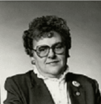
Sanford Town Clerk Broome County

"Education is the most powerful weapon which you can use to change the world." — Nelson Mandela