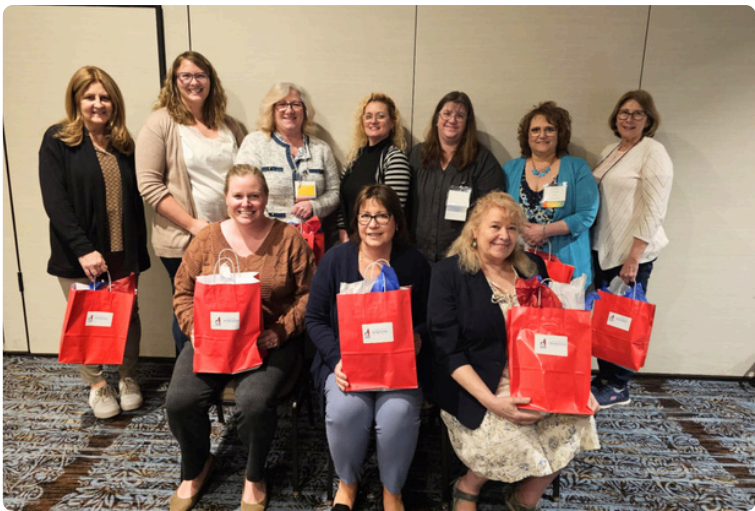
New Clerk Track Winners

Never stop learning, because life never stops teaching.